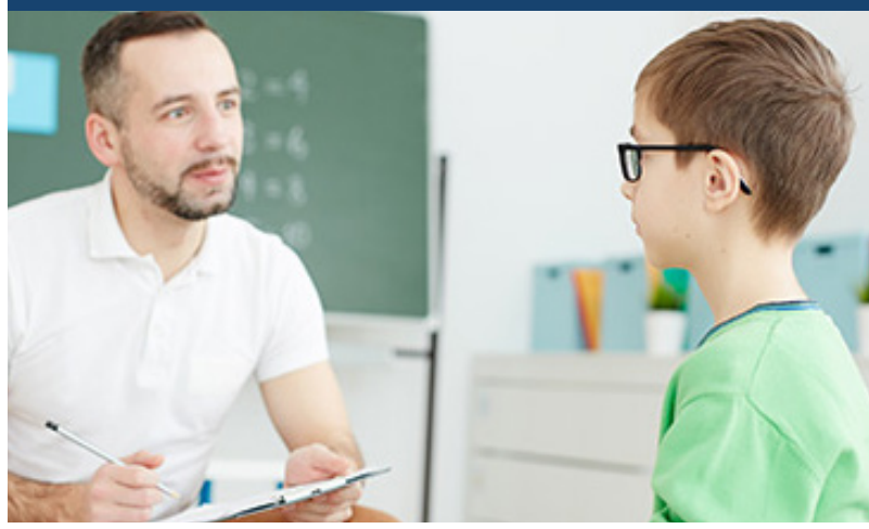
Module 5 Promoting Good Practice